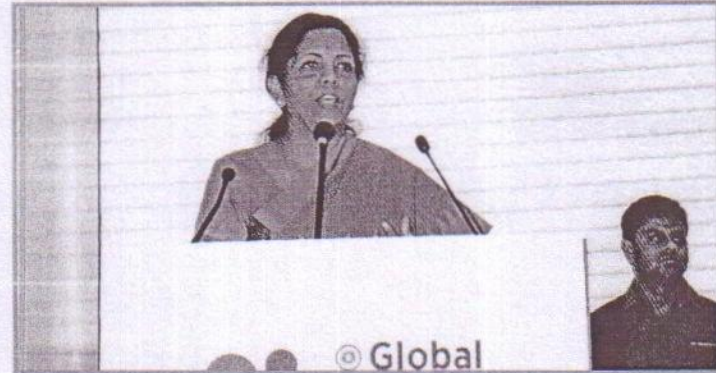
Smt. Nirmala Sitharaman Minister of State (Independent Charge) for Commerce & Industry, Government of India in GES 2016