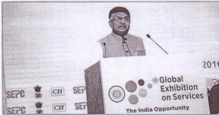
Sh. Ravi Shankar Prasad Minister for Communications & Information Technology and Law & Justice, Government of India in GES 2016