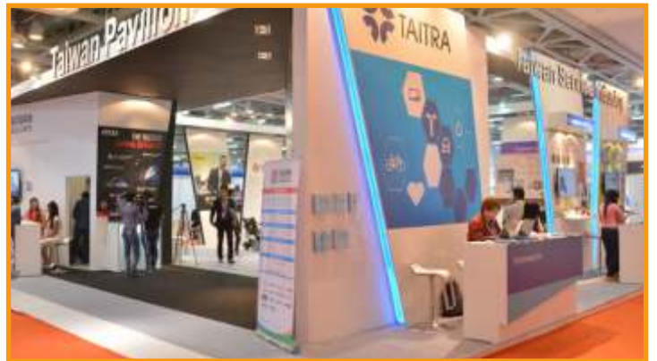
Exhibition Showcase in GES 2016