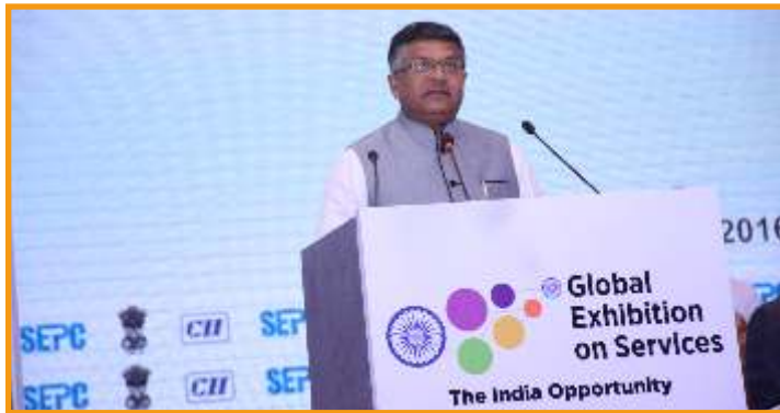
Sh. Ravi Shankar Prasad

Minister for Communications & Information Technology and Law & Justice, Government of India in GES 2016