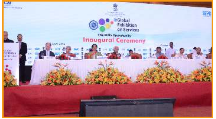
Inauguration of GES 2016 by Hon'ble President of India, Shri Pranab Mukherjee on 20 April, 2016