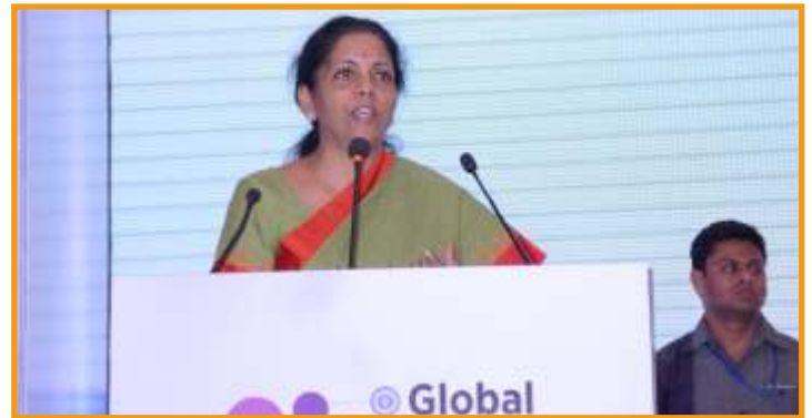
Smt. Nirmala Sitharaman

Minister for Communications & Information Technology and Law & Justice, Government of India in GES 2016